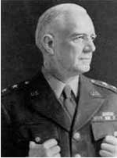
Gen. William J. Donovan