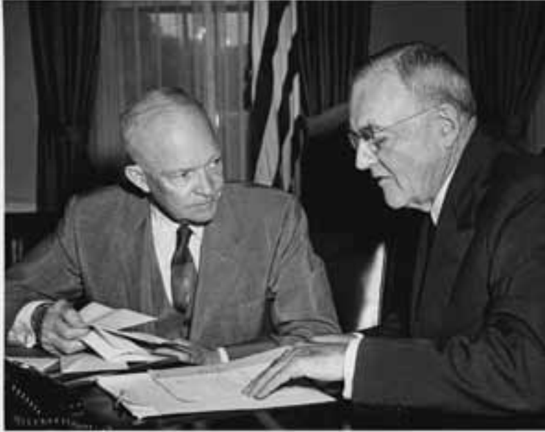
President Dwight D. Eisenhower and John Foster Dulles