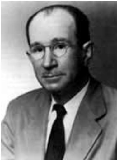
Harry Stack Sullivan