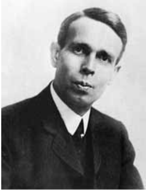
Edgar Gardner Murphy

In fact, in 1947 psychologists were just beginning to explore the roots of personality. 6 Data on the relationship between nature and nurture was skimpy and conclusions were only tentative. Proposals for further research far exceeded reliable answers. Gardner Murphy asserted, "Neither in content nor in method can we be said to have solved the essential problem of the starting point from which a psychology... of personality could be written." 7 Murphy thought that personality was "...apparently definable as a system of tensions or impulses or acts of will." 8 He thought those tensions might somehow be correlated with physical tensions, but a relationship between the two systems was not known. Professionals only knew that a human was a changeable biochemical system. Indeed, psychologists speculated that personality must be a "multi-dimensional trend phase of a complex developmental process." 9 In pursuit of that idea of the human as a "work in progress," Murphy wrote further,