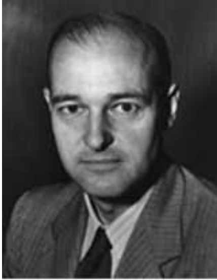
George F. Kennan published his doctrine of containment in the July 1947 issue of Foreign Affairs.

In early 1946, the obvious need for strategic intelligence called for an interim bureaucratic device. The President named the Secretaries of State, War and the Navy to a new "National Intelligence Authority," to be chaired by the Chief of Staff to the President. That committee soon spawned a Central Intelligence Group (CIG). Within the next year, it became painfully clear that the CIG could not begin to cope with the new challenges of the "Cold War," the label that Bernard Baruch and Walter Lippmann gave the emerging worldwide competition between the Soviet Union and the United States for political influence. Hoping to better manage American assets in that conflict, President Truman reorganized the government. In July 1947, the National Security Act created a unified Department of Defense, a National Security Council and the Central Intelligence Agency.