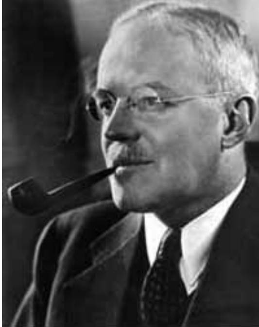
CIA Director, Allan Dulles